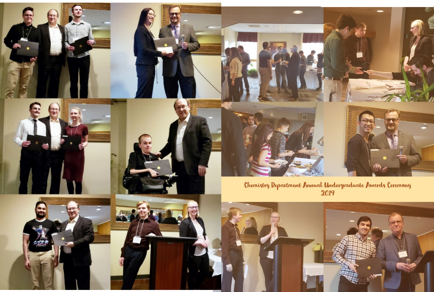
Chemistry Department Annual Undergraduate Awards Ceremony 2019